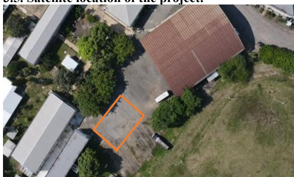
Figure n°2: Aerial view of the site delimiting the location of the project