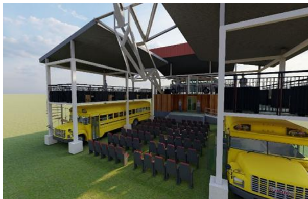
Figure N°1: General view of the project which has a capacity for 100 people for seats and 10 people standing on the ground floor and 15 people capacity on the upper floor.