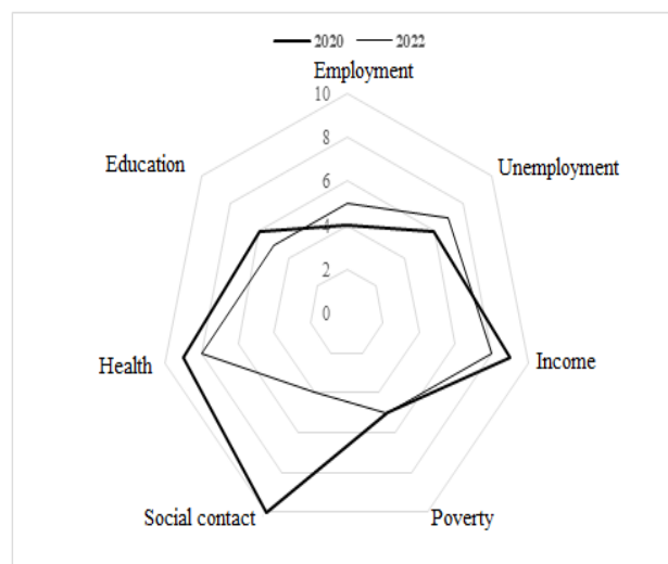
Figure 2. Socio-economic impact in Cantón Playas

household is made up of between 2 and 4 people, with the majority of cases having no young children, iii) Most of the respondents have not had close contact with a person infected with SARS-CoV-2. iv) In households where there are young children, their care is in charge of a relative between 21 and 30 years old who does not live in the same household, v) It is emphasized that the respondents have had to leave their homes to work, vi) It is interesting to know that 92.2% are independent employees who are mostly dedicated to tourist service activities including accommodation and food services; bars, entertainment and recreation as well as dining rooms, followed by beach activities such as renting tents, parasols, hammocks and selling crafts, vii) These independent employees belong to associations of tourism service providers who have spent the months of pandemic with their savings, decreased their income and had no monthly income in the last six months, before the pandemic the monthly income was 1–500 dollars, viii) The impact in terms of work/business was very significant, they consider that to date they have not fully recovered. As indicated in Figure 2, for the second period (year 2022), the results were as follows: