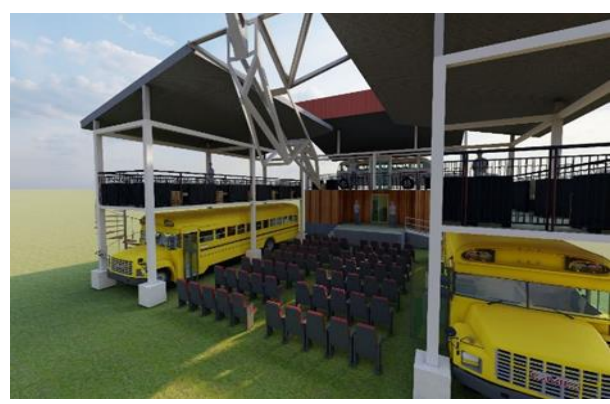
Figure N°1: General view of the project which has a capacity for 100 people for seats and 10 people standing on the ground floor and 15 people capacity on the upper floor.

ISSN - p: 1390 -9428 / ISSN - e: 3028-8533 / INQUIDE / Vol. 06 / N° 01