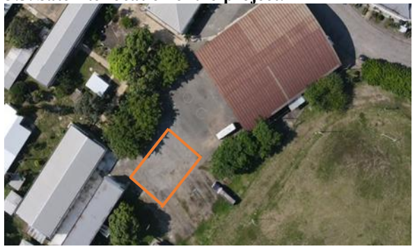
Figure n°2: Aerial view of the site delimiting the location of the project