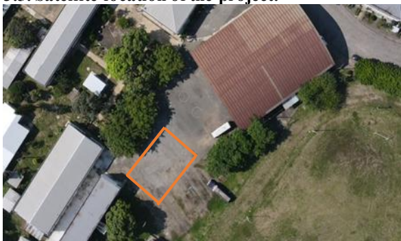
Figure n°2: Aerial view of the site delimiting the location of the project