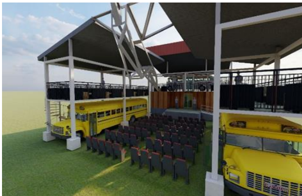
Figure N°1: General view of the project which has a capacity for 100 people for seats and 10 people standing on the ground floor and 15 people capacity on the upper floor.