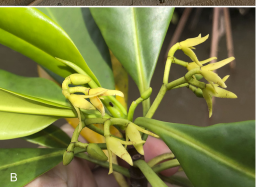
Fig. 1. Rhizophora samoensis, terminal leafy branches and inflorescences holding 6 to 7 flowers, from Upolu island, Samoa. A. Close up from G Isotype. B. Fresh material.— A Courtesy of G Herbarium. B. Courtesy of YERO KUETHE.