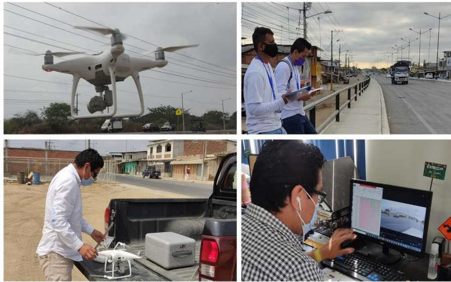
Figure 2. Techniques and instruments used in the investigation. Author Presentation

The aforementioned avenue has a very particular geometry, where its variables range from widths of the road, lengths of access, and road signs to behavior in the directions of the road. It is also due to indicate that vehicular flows are intermittent during the daily shift; these flows sometimes tend to generate congestion as a result of the entry and exit of heavy and extra-heavy vehicles from the main road to the smaller road and vice versa.